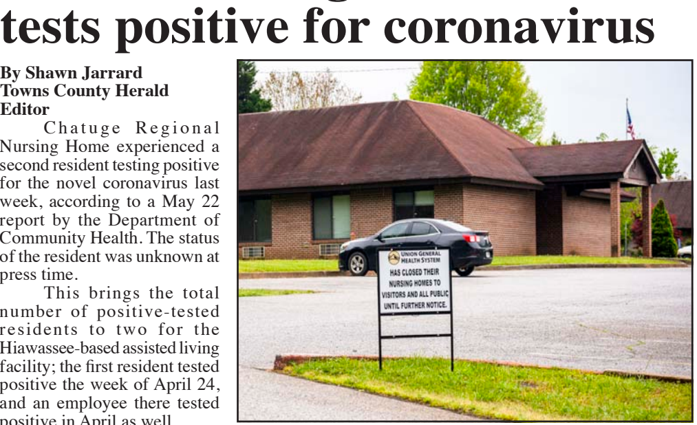
Due to the pandemic, the Chatuge Regional Nursing Home is closed to visitors until further notice.

for Disease Control and Prevention issued new guidance recommending mass testing of residents and health care professionals inside nursing homes where a positive test