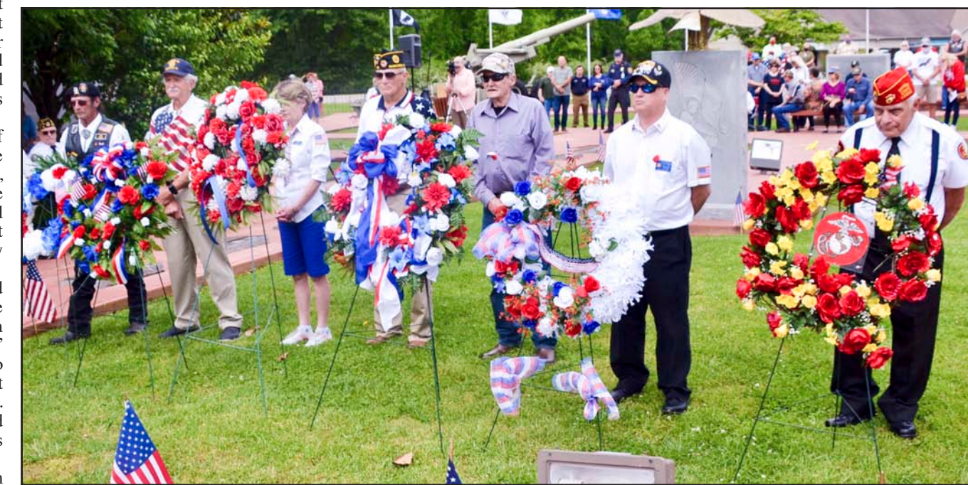
The laying of the memorial wreaths is always an important part of the annual Towns County Memorial Day Service.

"We know what freedom is; we are living it right now, See Memorial Day, Page 8A