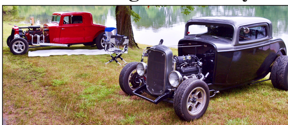
This summer, the Annual Georgia Mountain Moonshine Cruiz-In will once again rev its way into the Georgia Mountain Fairgrounds, this year with special COVID-19 precautions in place.